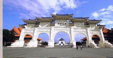
TAIPEI C.K.S MEMORIAL HALL