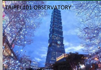
TAIPEI 101 OBSERVATORY