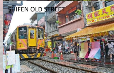
SHIFEN OLD STREET