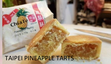
TAIPEI PINEAPPLE TARTS