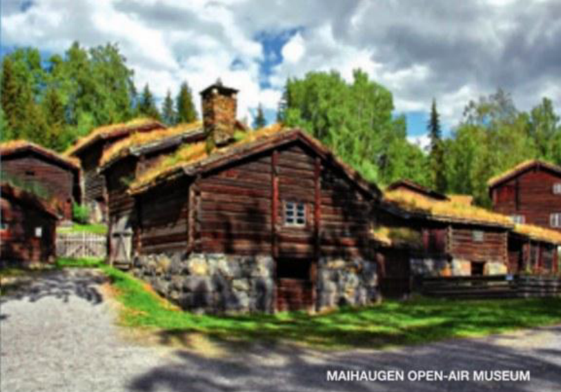
MAIHAUGEN OPEN-AIR MUSEUM