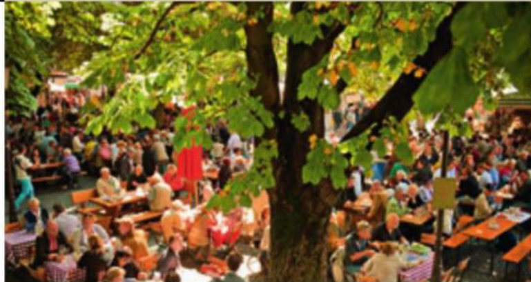
Lf LOCAL FAVOURITE IN MUNICH, CELEBRATE THE SUCCESS OF YOUR TOUR AT A LIVELY BIERGARTEN .

DAY 8 MUNICH. (Sun.) Your holiday ends with breakfast this morning. (B)