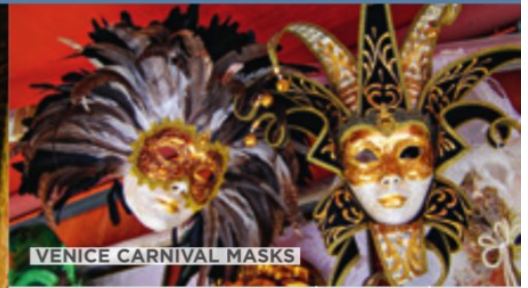
VENICE CARNIVAL MASKS