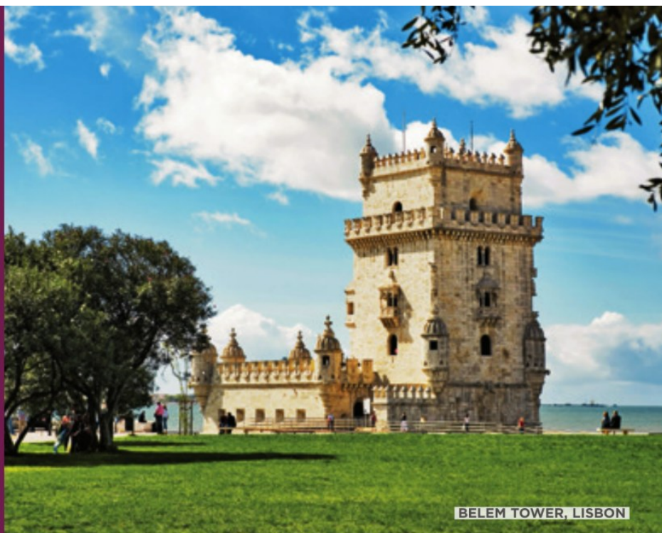
BELEM TOWER, LISBON