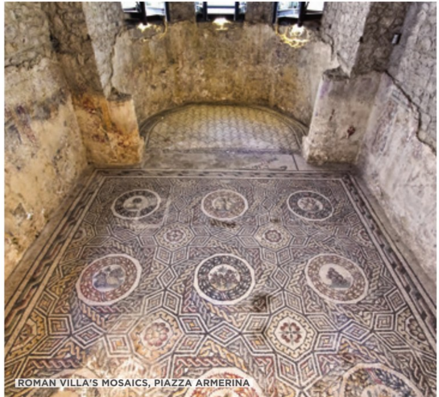
ROMAN VILLA'S MOSAICS, PIAZZA ARMERINA

Today, travel through the rustic mountainous scenery of Italy's southernmost region, Calabria, before boarding the FERRY for a 45-minute