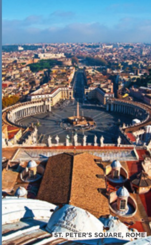
ST. PETER'S SQUARE, ROME