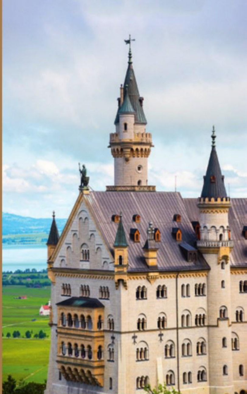
LF LOCAL FAVOURITE VISIT KING LUDWIG'S NEUSCHWANSTEIN CASTLE, WHICH INSPIRED WALT DISNEY.

NOTE Hitler's Eagle's Nest is normally open from mid-May to end-Sept. Check with your Tour Director for the availability of this excursion.