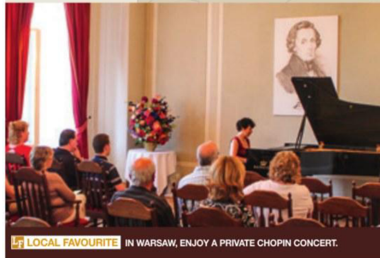
LOCAL FAVOURITE IN WARSAW, ENJOY A PRIVATE CHOPIN CONCERT.