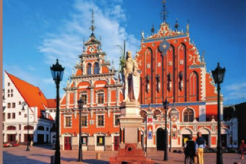
LF LOCAL FAVOURITE DURING YOUR SIGHTSEEING IN RIGA, TASTE RIGA BALSAM (A TRADITIONAL LATVIAN HERBAL LIQUEUR) AND LAIMA CHOCOLATE.

For a more detailed itinerary on Tours RQM and RQE, see Tour RX on page 50.