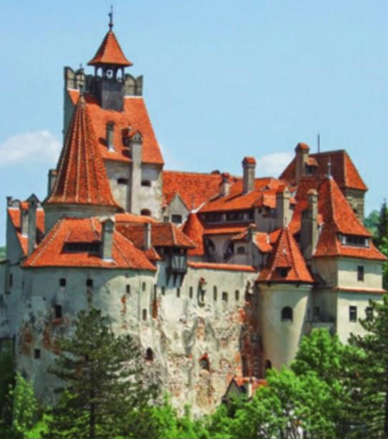
LOCAL FAVOURITE VISIT DRACULA'S 14TH-CENTURY BRAN CASTLE, DRAMATICALLY LOCATED ON TOP OF A HILL.