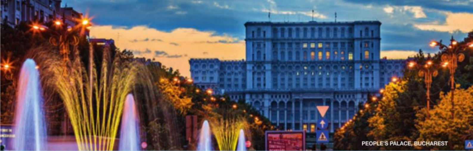
PEOPLE'S PALACE, BUCHAREST