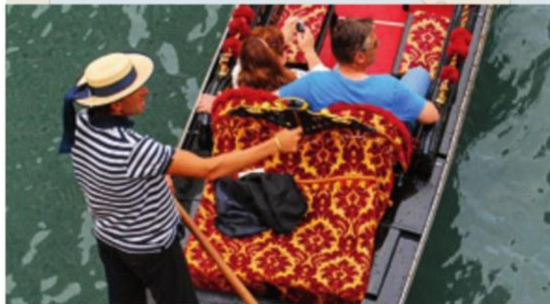
Lf LOCAL FAVOURITE THINK OF VENICE AND YOU THINK OF GONDOLAS—ENJOY A ROMANTIC, SERENADED RIDE THROUGH THE MAZE OF CANALS.