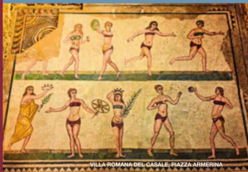
VILLA ROMANA DEL CASALE, PIAZZA ARMERINA

LF LOCAL FAVOURITE ENJOY A BOAT CRUISE TO THE ISLAND OF MOTYA, FOLLOWED BY DINNER WITH LOCAL SPECIALTIES AND COUSCOUS IN MARSALA.