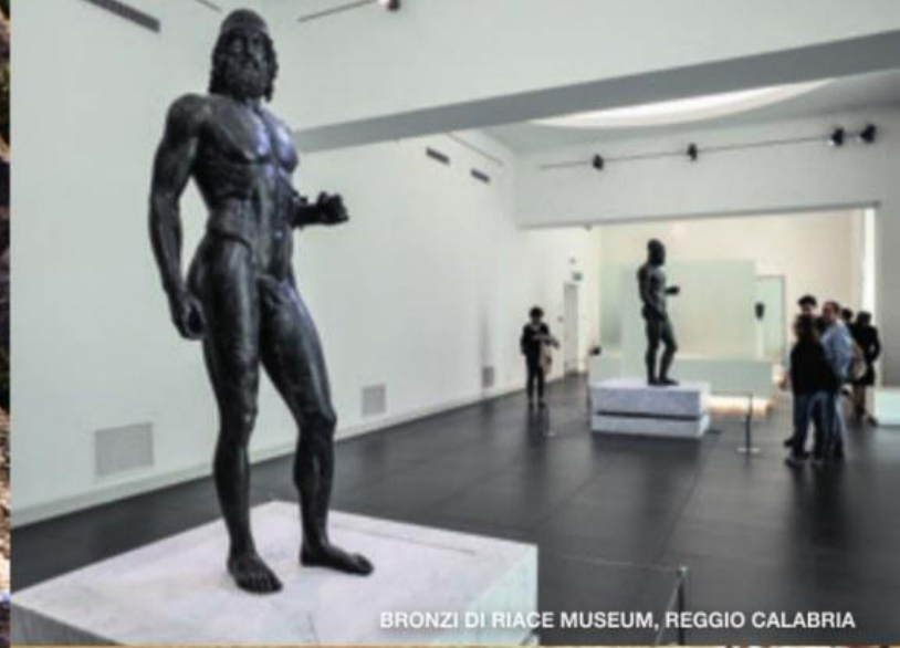
BRONZI DI RIACE MUSEUM, REGGIO CALABRIA