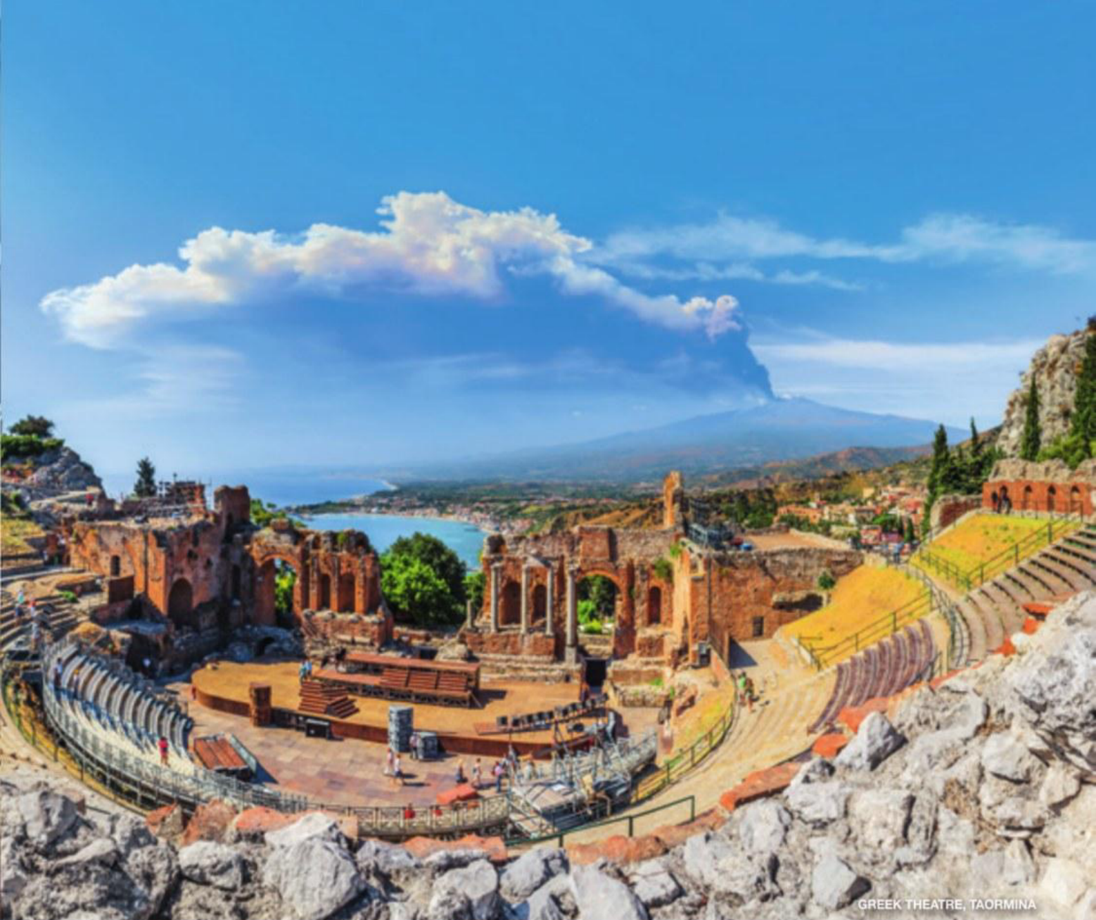
GREEK THEATRE, TAORMINA