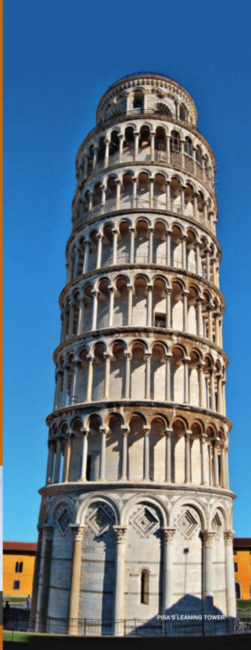
PISA'S LEANING TOWER

Lf LOCAL FAVOURITE IN FLORENCE, VISIT SANTA CROCE BASILICA TO SEE THE TOMBS OF MICHELANGELO, DANTE, ROSSINI, AND OTHER HISTORIC CELEBRITIES.