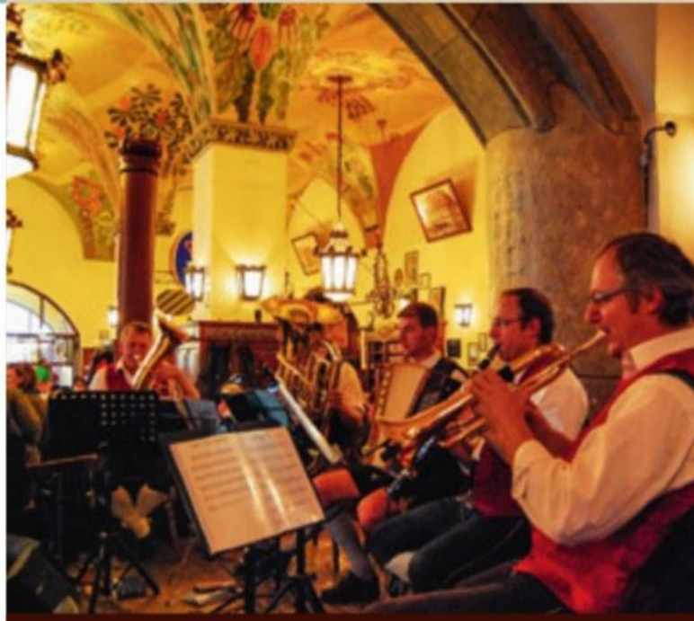
🏠 LOCAL FAVOURITE A HIGHLIGHT IN MUNICH IS A VISIT TO THE FAMOUS HOFBRÄUHAUS, DATING BACK TO 1589.

Morning transfer to Zurich Airport in time for homebound flights leaving no earlier than 10 am. Extra nights are available in Zurich, not Lucerne. (B)