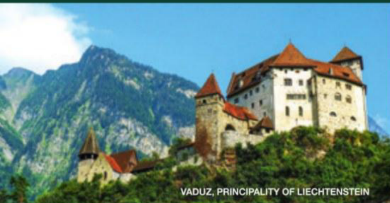
VADUZ, PRINCIPALITY OF LIECHTENSTEIN

A smooth drive past the Dutch region best known as the locale of A Bridge Too Far brings you to the Rhine Valley. Stop in Cologne and see the awesome twin-spired gothic cathedral. Overnight in Koblenz, where the Moselle River flows into the Rhine River. Why not join an exciting optional excursion to one of the more famous castles, Marksburg, from where you have spectacular views of the river below? (B,D)