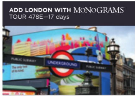
ADD LONDON WITH MONOGRAMS TOUR 478E—17 days

This Monograms portion of your holiday includes travel by high-speed Eurostar train (Standard class) from Paris to London, transfers to/from train stations, three overnights, guided sightseeing, and services of an expert Local Host.