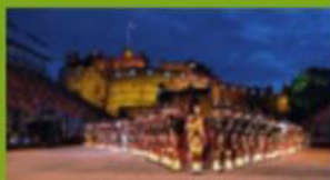
EDINBURGH MILITARY TATTOO ticket included for departures 0729 through 0819

■ MyACCOUNT Personalise your tour ahead of time with additional excursions. Visit our website for details and conditions.