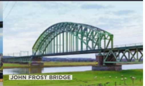
JOHN FROST BRIDGE