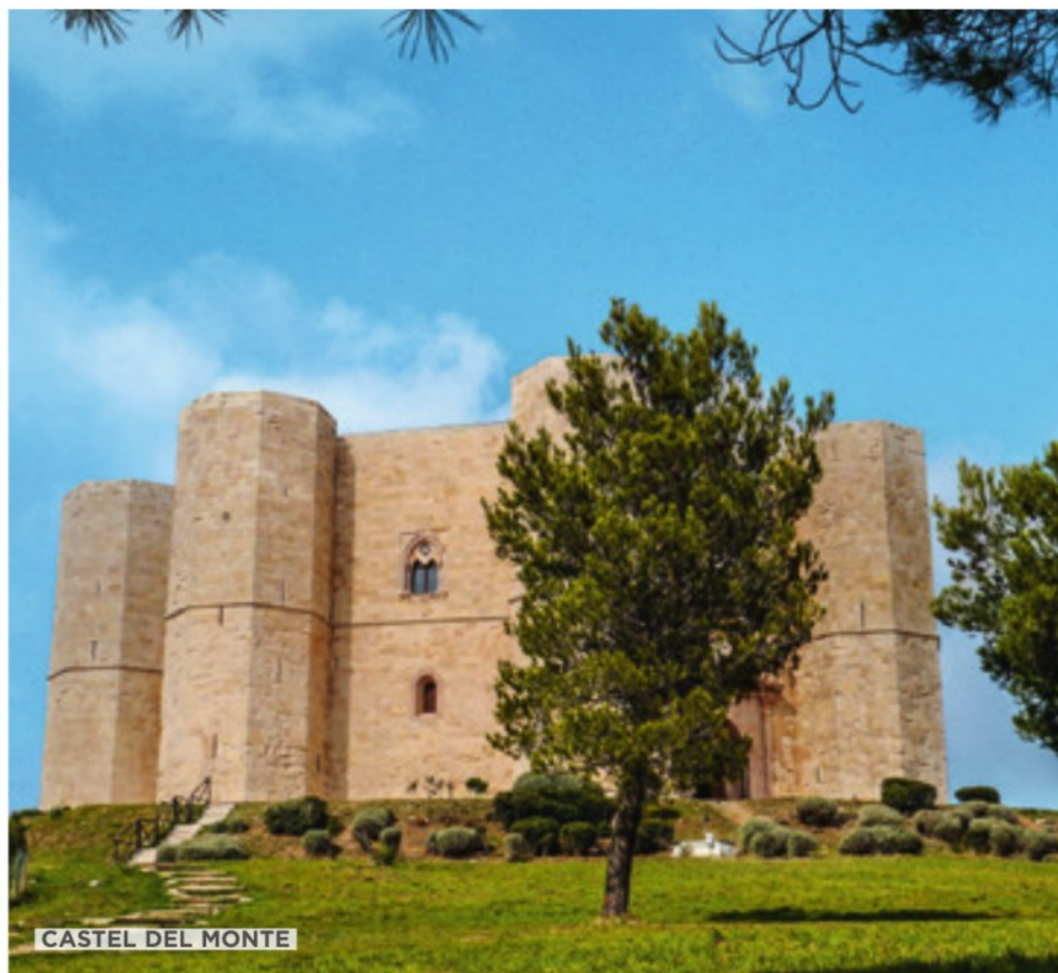
CASTEL DEL MONTE

morning gives you a proper introduction to the eventful history of this city and its traditions. Later, depart Naples and travel into Apulia, the legendary “boot” of Italy. Stop at CASTEL DEL MONTE, built in the 13th century by Holy Roman Emperor Frederick II and renowned for its unique octagonal towers, now a UNESCO World Heritage Site. Continue to the Adriatic