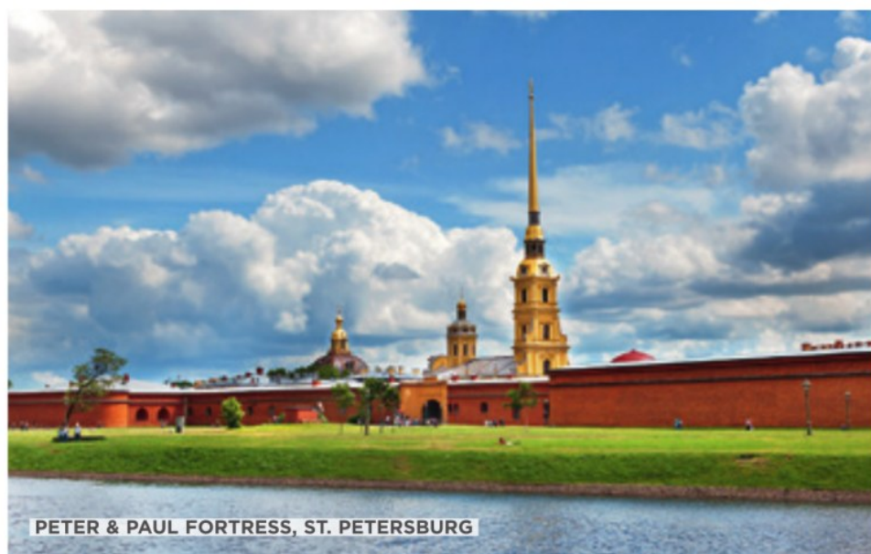
PETER & PAUL FORTRESS, ST. PETERSBURG

Day 4, Mon. MOSCOW-KLIN-TVER. Leave Moscow and travel northwest, stopping in pretty Klin. Discover the historic CHRISTMAS DECORATIONS at the local museum and have a go at decorating your own to take home. Then, explore the TCHAIKOVSKY HOUSE-MUSEUM, former country home of composer Pyotr Tchaikovsky. This is where he wrote